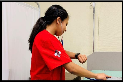
Medical Education & Research